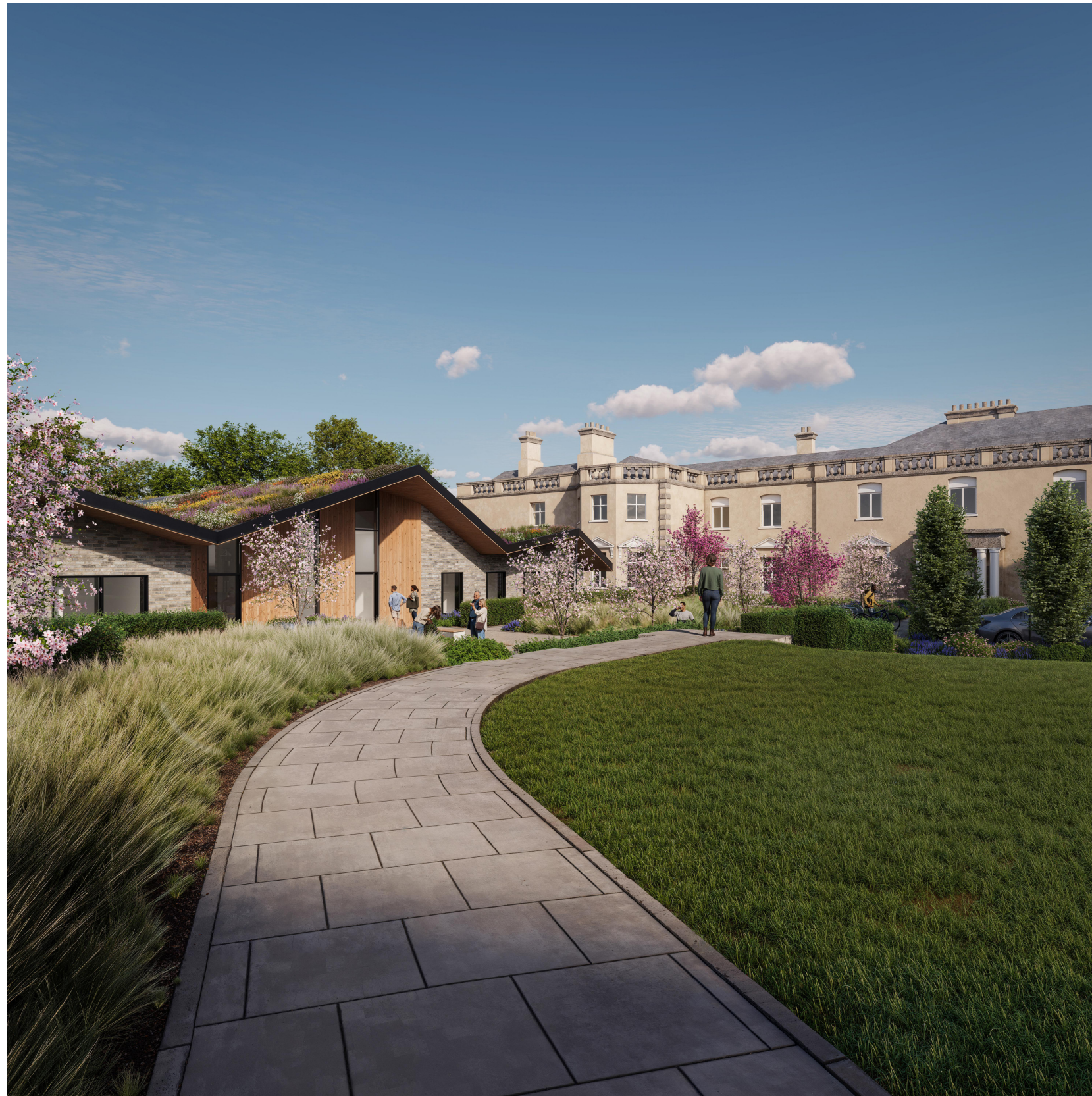
14-Bed Adolescent In-Patient Unit and Saint Edmundsbury House

COPYRIGHT: The design and details shown on this drawing are applicable to The Named Project only and may not be; reproduced, modified or relayed in whole or part or be used for any other project or purpose without the prior written permission of TOT Architects with whom copyright resides. DO NOT SCALE this drawing. Use figured dimensions only. The Contractor is responsible for checking all levels and dimensions on site prior to commencement of works. Any discrepancies are to be referred to the ARCHITECT. Drawings to be read in conjunction with all other Consultants Drawings & Specifications were relevant. Proprietary items shall be fixed in strict accordance with the Manufacturer's Instructions. Sizes of proprietary items shall be checked with Manufacturer.